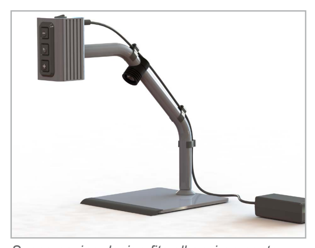
Space-saving design fits all environments.