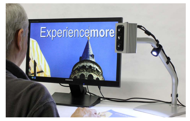
Enjoy reading again without complex technology!