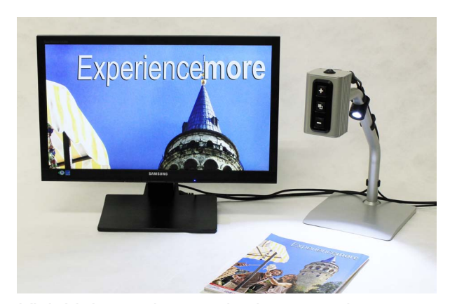
VisioLight can be attached to a monitor.