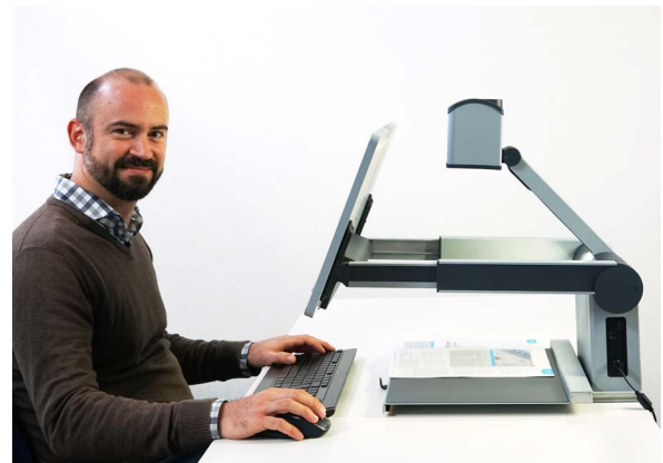
VisioPro: the Full HD solution for reading and writing