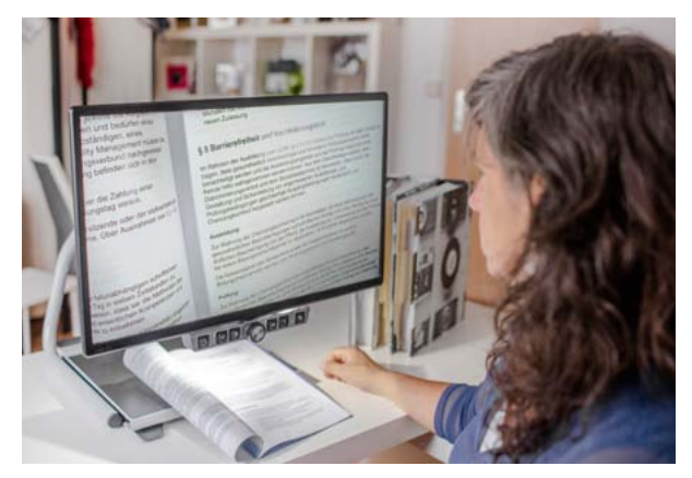
The aesthetically pleasing and space-saving design fits all environments.

Place your documents and objects on the XY-table and VISIO 24 magnifies them on a widescreen monitor. Size, contrast and brightness can be adjusted to suit your needs. All the controls are mounted at the bottom of the screen for easy access, and are large and logical. For difficult reading material such as newspapers, the VISIO 24 can enhance the text making it clearer. VISIO 24 is the standard model with 6 buttons and offers more contrasting colour combinations. VISIO 24 is the perfect solution for independent living.