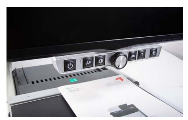
Easy to use function keys on the front.