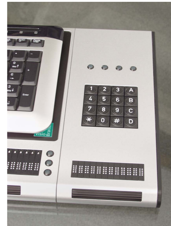
The modules are fitted either to the left or the right side of VarioPro.

The Switchboard Operating Module (2) is used in workplaces for accessing software used for operating PBX attendant consoles and in call centers. It has four configurable function keys, a 16-key number panel for handling incoming/outgoing calls or performing calculations, one additional roll-bar and an additional 12-cell Braille display. This function module increases the efficiency of a blind or visually impaired operator or call center agent tremendously.