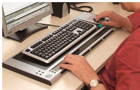
Practical function modules create an individual and highly effective workplace.

VarioPro provides exceptional levels of functionality for use in the workplace, or in higher education settings. Used alone, it is ideal for working with MS-Office applications such as Excel and Word, as well as with other applications common in the workplace. VarioPro can provide new levels of access for more complex tasks or applications, such as call-center software.